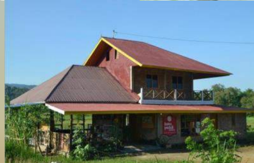
Traditional handicraft can provide women with a job