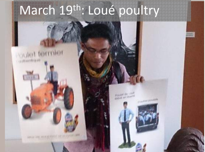
March 19 th : Loué poultry