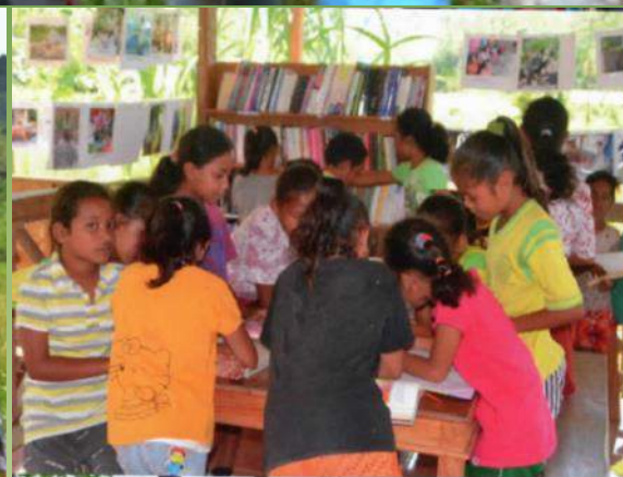
Alternative educational material in the « social transformation center »

Scholarships for young people from marginalized communities