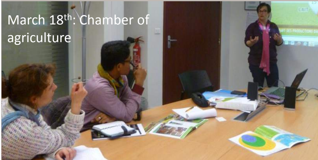
March 18 th : Chamber of agriculture