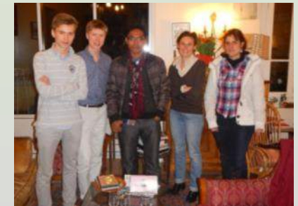
Friday, March 21 st : with young Catholic s from La Flèche. Do you want to dance?