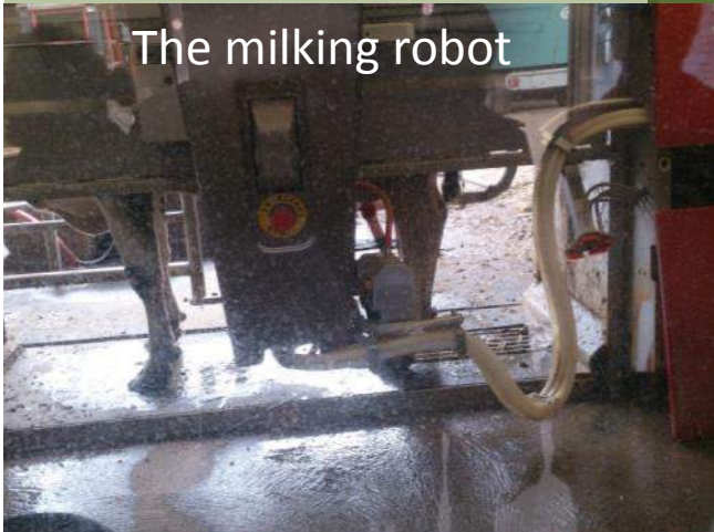
The milking robot

Agricultural high school la Germinière at Rouillon