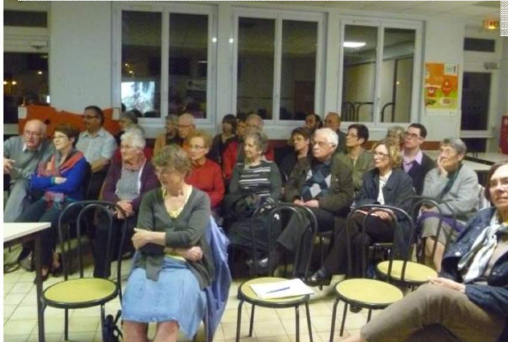
Thursday, March 20 th : Allonnes