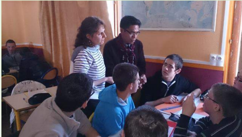
Thursday, March 20 th : Maison familiale rurale at Bernay en Champagne