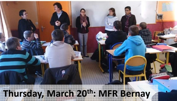
Thursday, March 20 th : MFR Bernay